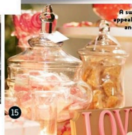
A sweets bar appeals to kids and adults.