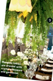
9 Marquee tables are dressed with crystal chandeliers and gardenias.