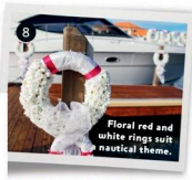
Floral red and white rings suit a nautical theme.