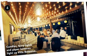
Candles, fairy lights and paper lanterns light up Villa Botanica.