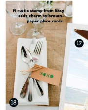
A rustic stamp from Etsy adds charm to brown paper place cards.