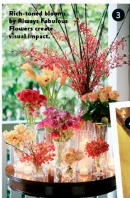
Rich-toned blooms by Always Fabulous Flowers create visual impact.