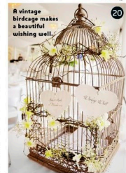
20 A vintage birdcage makes a beautiful wishing well.

9 Green thumb Add lush greenery. "Hanging ferns mixed with bamboo lights and rattan lampshades bring the outside in, creating a chic plantation feel." Rouba Alamein, The Style Salon (thestylesalon.com.au).