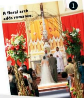
A floral arch adds romance.

8 Nautical notes Cover lifesaving rings in white daisies and fuchsia ribbon to decorate sea-themed nuptials. "Dress up an empty pool space with floral pool rings – they can be stabilised to float in one spot when anchored down with weights." Cathrin D'Entremont.