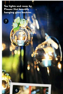
Tea lights and roses by Flower Hut beautifully hanging glass baubles.