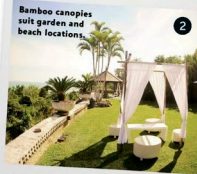
Bamboo canopies suit garden and beach locations.