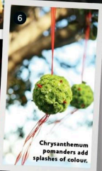
Chrysanthemum pomanders add splashes of colour.