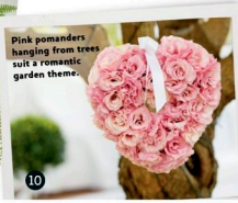
10 Pink pomanders hanging from trees suit a romantic garden theme.