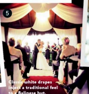
Classic white drapes inject a traditional feel to a Balinese hut.